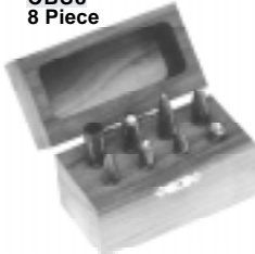
CBS8 8 Piece