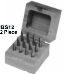
CBS12 12 Piece