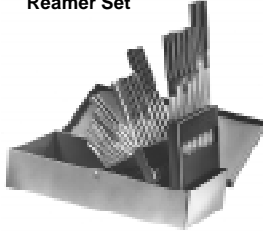
550SF Fractional Straight Shank Chucking Reamer Set